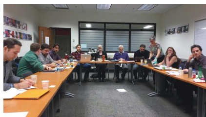
RPLC members meetings held at Concordia University, Montreal.