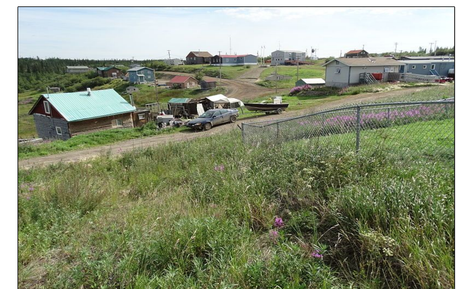
Inuvik, Northwest Territories