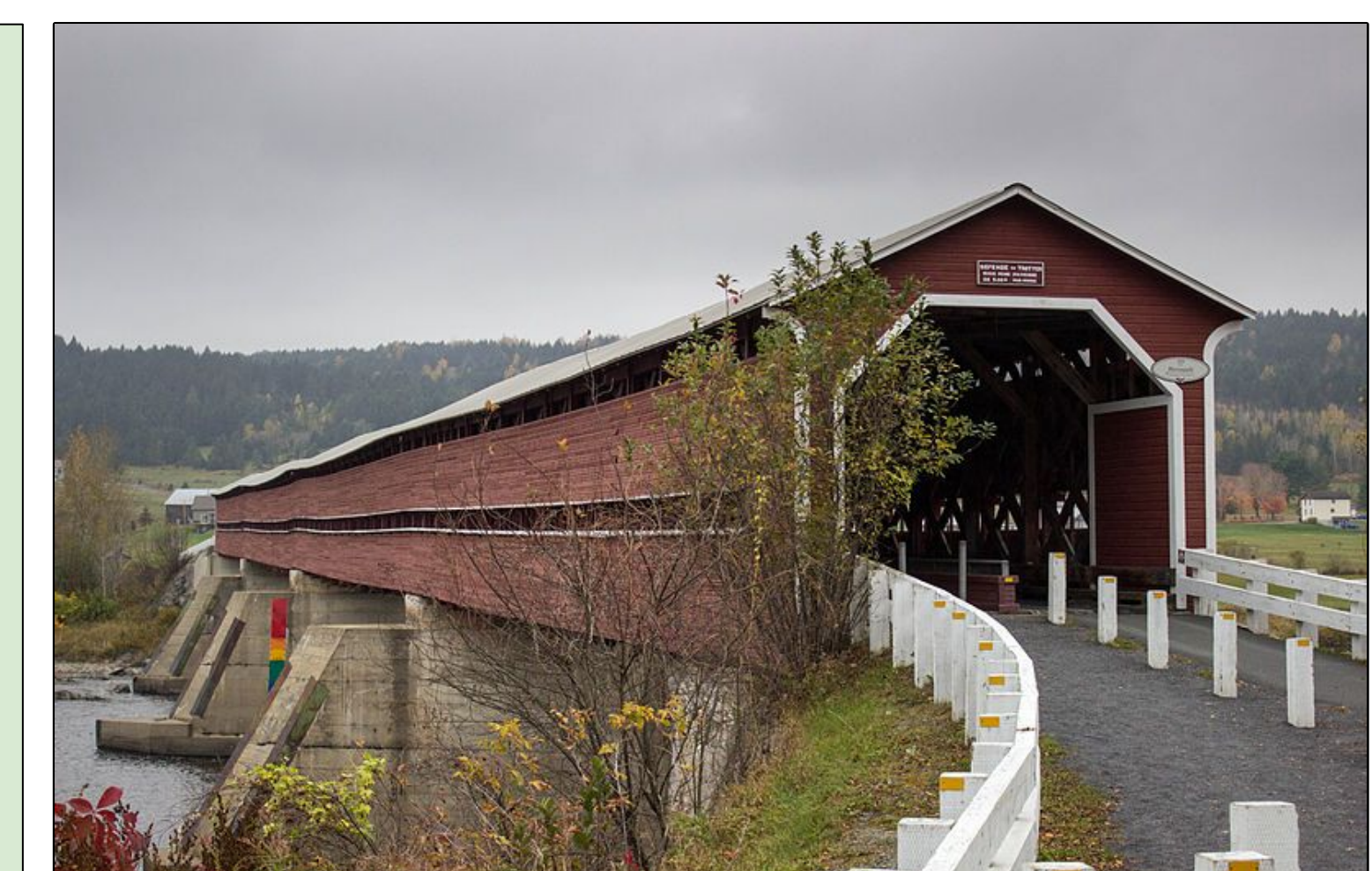
Pont Perrault, Quebec