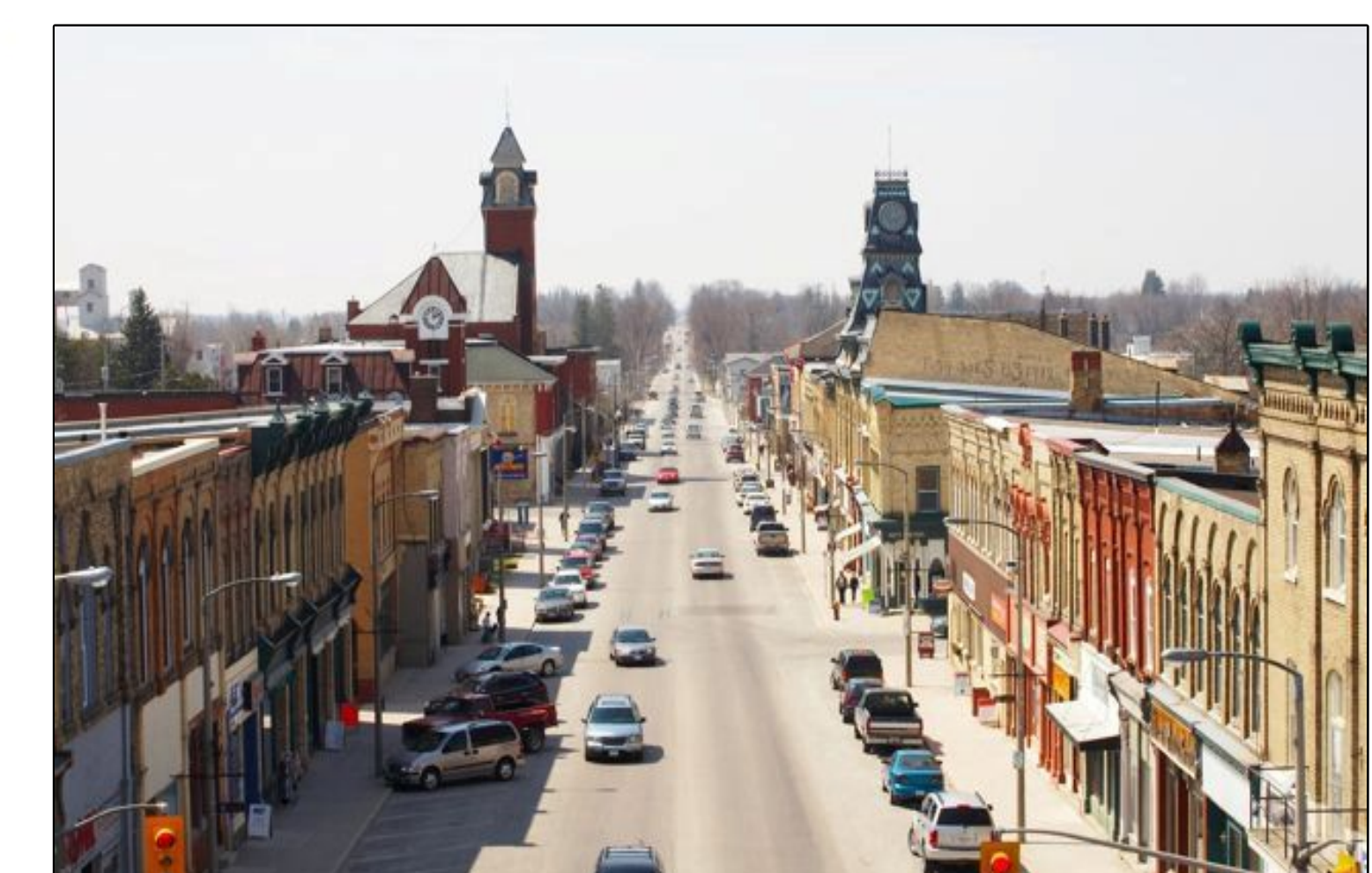
Seaforth, Ontario